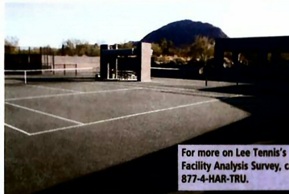
For more on Lee Tennis's Facility Analysis Survey, call 877-4-HAR-TRU.